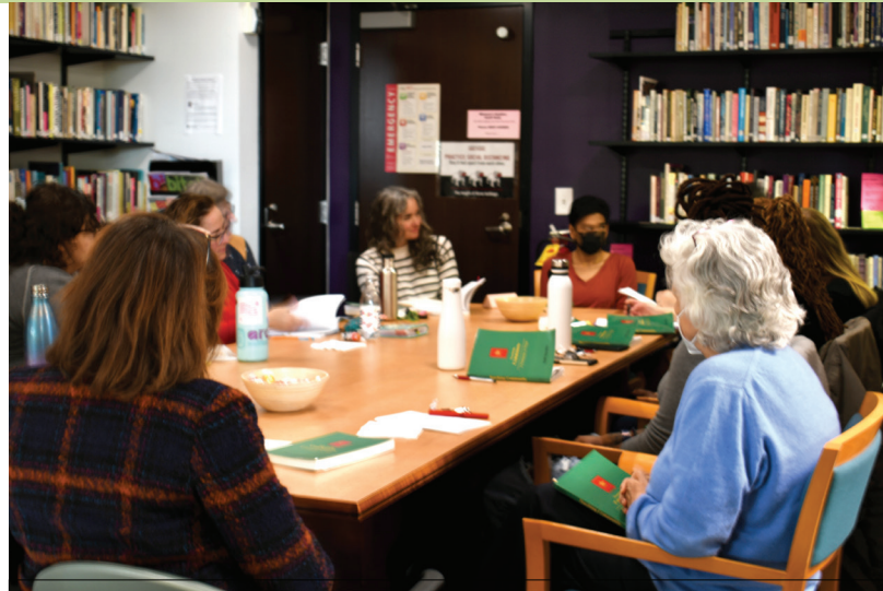
Faculty & Grad Students gather in the Women's Studies Library to discuss bell hooks' Teaching Community: A Pedagogy of Hope as part of the IWS Book Club.